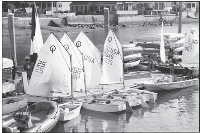
Sailboats, kayaks and more available for use at CPYC.

come find out more. The doors open at CPYC, 76 Orlando Ave. in Winthrop, at 1 p.m. on Sunday, March 10.