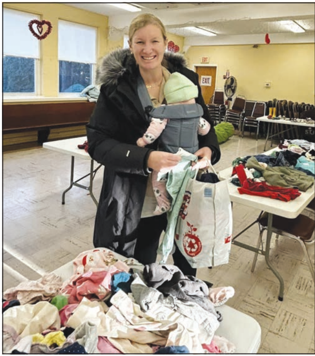
A resident looks over some of the items at the Project Play Swap Shop.

Starting with the landmark "Spring Swap Shop" in April 2023, which brought over 100 people out to donate baby and small child clothing and equipment they no longer need and swap them for things they do need, and would otherwise have to buy new, Project Play has taken to a regular cadence of "swap shops" during which people can bring in bags of outgrown clothing and walk out with items that fit their children. All items left over at the end of the swaps are donated to local charity, including victims of the Veter-