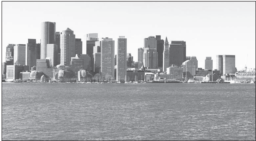
The Boston skyline as seen from the Harbor.