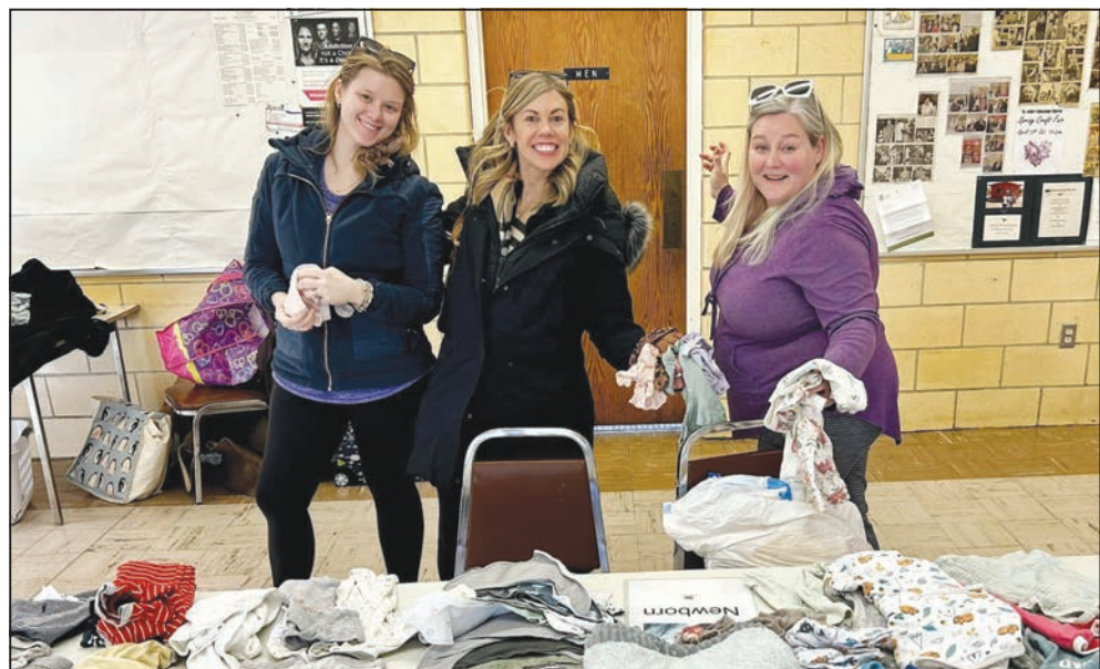
Mothers at the Swap Shop.

Stay tuned for details about the next swap shop by following Project Play on Facebook and Instagram, or signing up for email updates at project-playwinthrop.org .