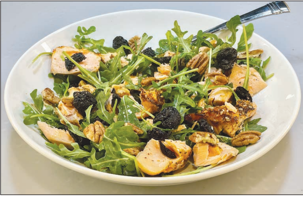
Our spicy grilled salmon, dried cherry, and pecan version of an arugula salad is a favorite busy-day meal.

Another option for home cooks and restaurant chefs is to change their regular menu to include seasonal ingredients intentionally. The local asparagus season is so short that we will incorporate it into our meals many