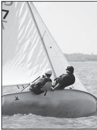
Young members sailing on the harbor.