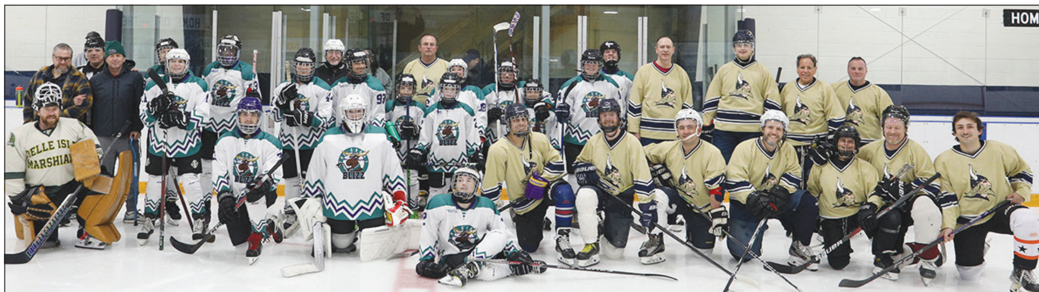
The Winthrop Police Dept. Hockey Team and the Great Blizz at Larsen Rink last Saturday evening.