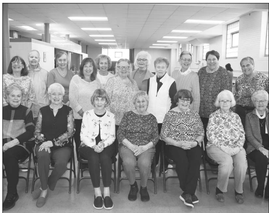
The members of the Winthrop Catholic Women’s Club are pictured at the 15th Annual Charity Bowl held April 16 at the Parish Center cafeteria.