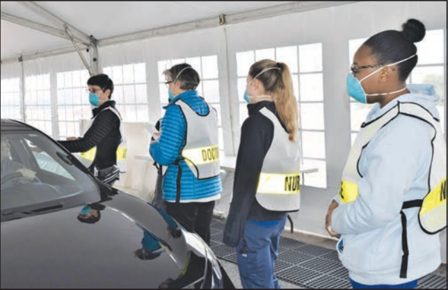
A car pulls up to the drive-thru testing site as EBNHC staff prepares.