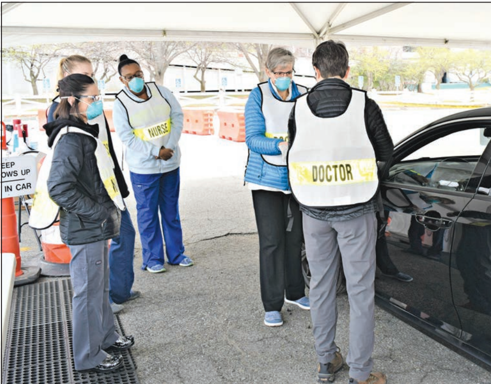
On Saturday the City of Boston, the East Boston Neighborhood Health Center (EBNHC), local healthcare providers and HYM Investment Group teamed up to test the city's First Responders at Suffolk Downs for COVID-19. The drive-thru testing site at Suffolk Downs was only open to qualified EMTs, firefighters and police officers.