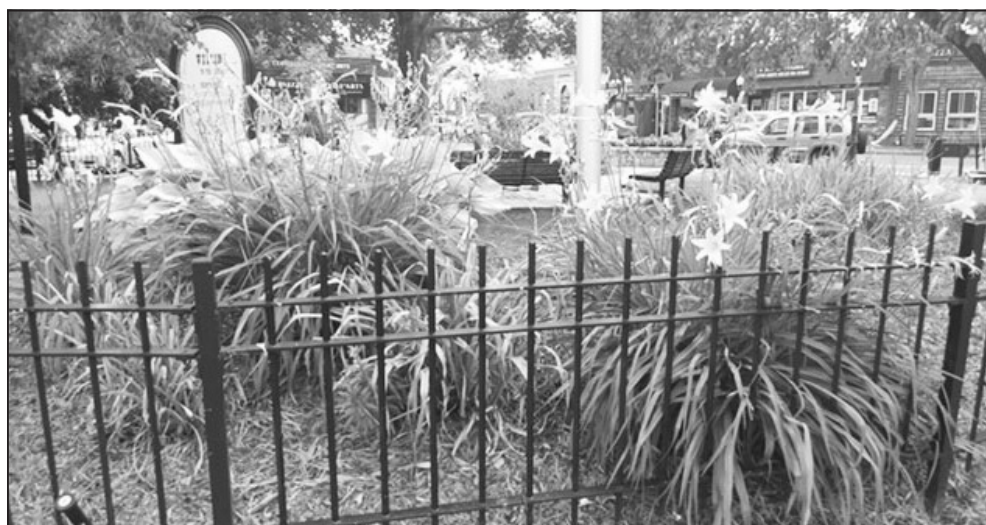
Yellow Daylilies on Berm.