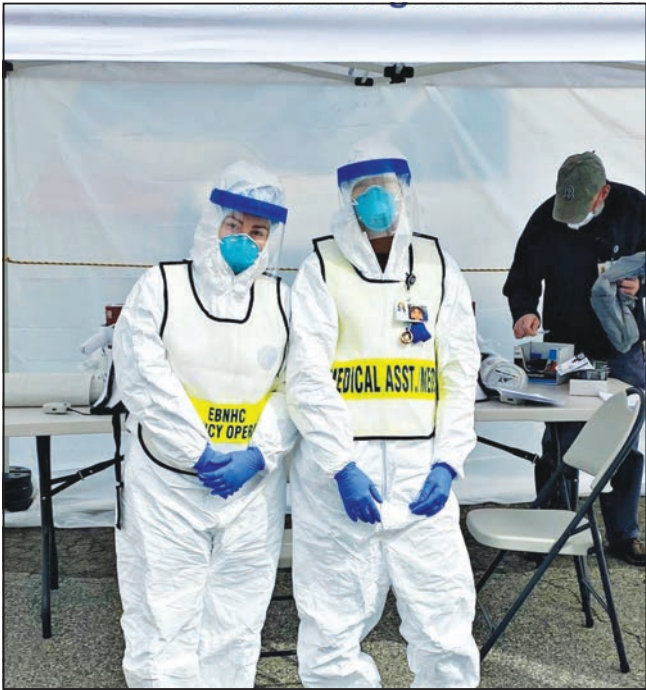
Leaving nothing to chance, EBNHC staff conducting the tests wore full protective gear.