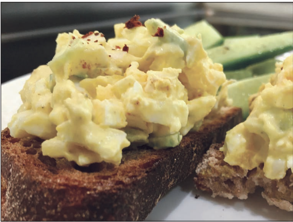
Our favorite egg salad is made with reduced-fat yogurt, served on whole-grain bread, with a vegetable on the side.

He goes on to point out that what you eat with eggs is a more important factor